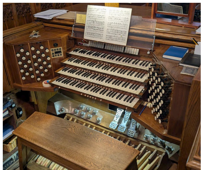
Our 4-Manual organ, built by Canadian builder, Casavant

Children will learn music from many different ages and learn the skill of reading music notation, giving them a life-long ability to pick new music up and simply sing it!